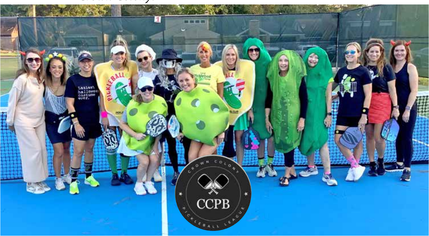
The Crown Colony Pickleball league celebrated Halloween during their Wednesday night league play at the Home Owners Pickleball courts.